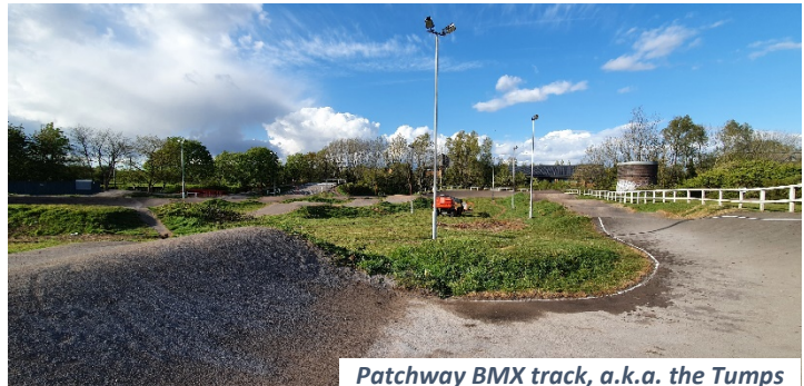
Patchway BMX track, a.k.a. the Tumps

As some residents pointed out, it would be great if there were a pump track to help get children and adults alike on their surfskates. Having somewhere for surfskaters to practice would open up a new avenue into sport and fitness, but would also tie in very well with further improving our surfing skills at the Wave in Easter Compton.